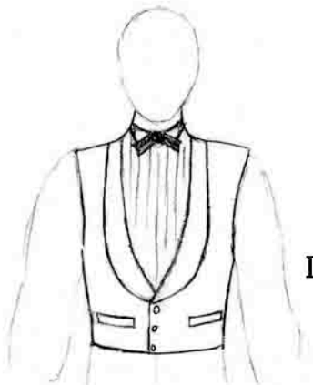
Evening Dress Waistcoat Low cut shawl collar Two pockets

Note: Evening waistcoats worn with and evening dress coat should be white or black silk. If worn with a frock coat may be colored.